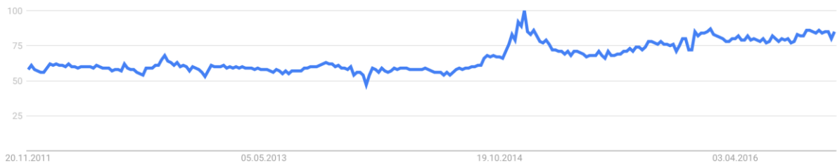
Fig. 1 Interest in searching the term “podcast” on a global scale in time (from 20.11.2011 to 20.11. 2016)

Source: Google Trends [accessed: 20.11.2016]