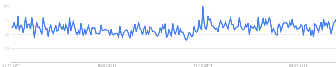
Fig. 3 Interest in searching the term “podcast” in Poland in time (from 20.11.2011 to 20.11.2016)