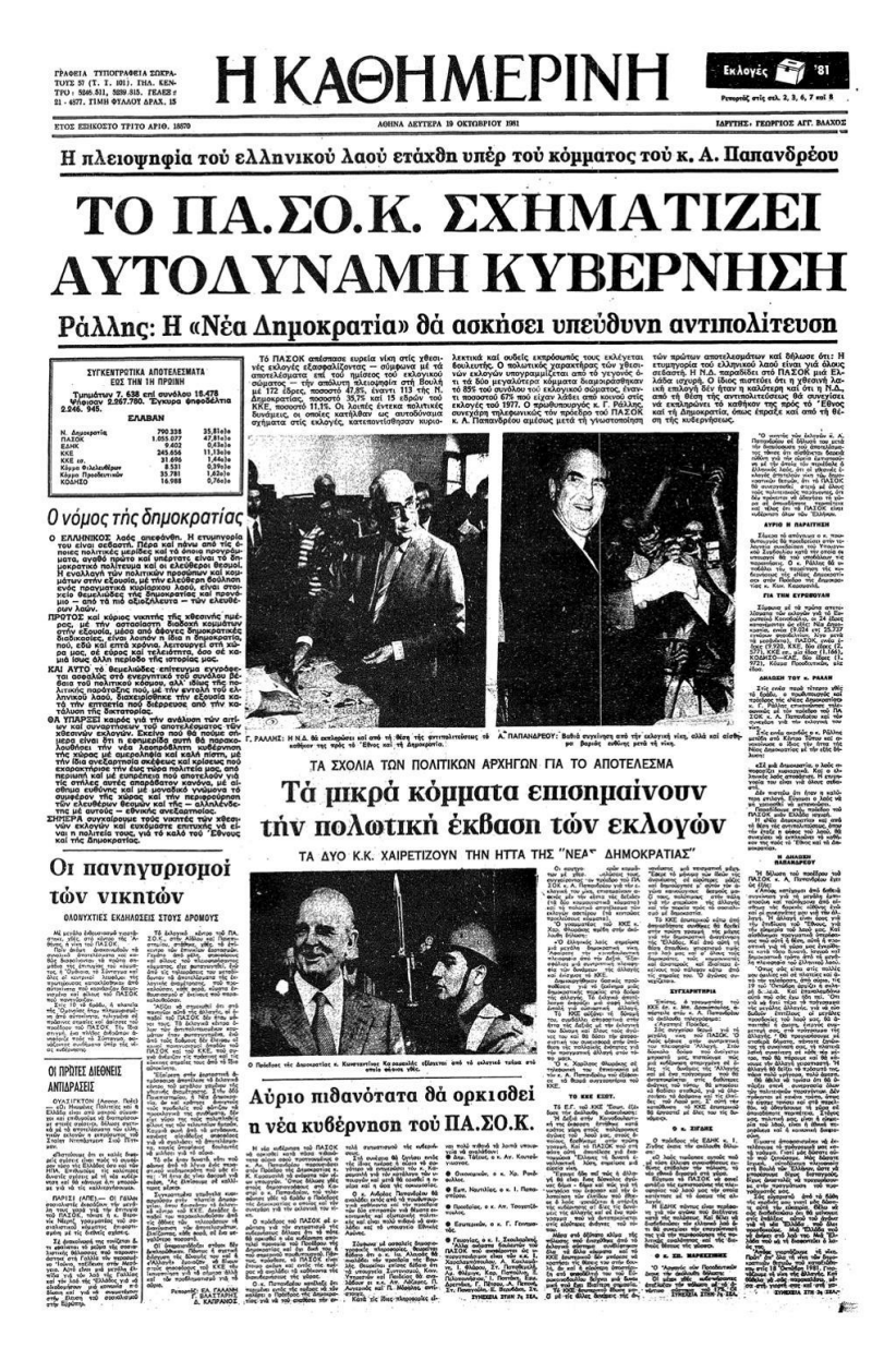
Fig. 2. The front page of the Athenian daily "Kathimerini" from 19 October 1981, relating the electoral victory of PASOK. In the pictures, top left Georgios Ralllis, the leader of the

would go deep, since, as one of the close collaborators of Papandreu said, "currently even the camera operators in the ERT are openly in support of the New Democracy". Journalist Giorgos Romeos was appointed the president of the national broadcaster; he was tasked with immediate implementation of the provisions of the Media Act of 1975 regarding the inclusion of the military YENED television into the ERT structures, which was successfully suspended during the previous term of the parliament by the conservative faction who sympathized with the army<sup>9</sup>.