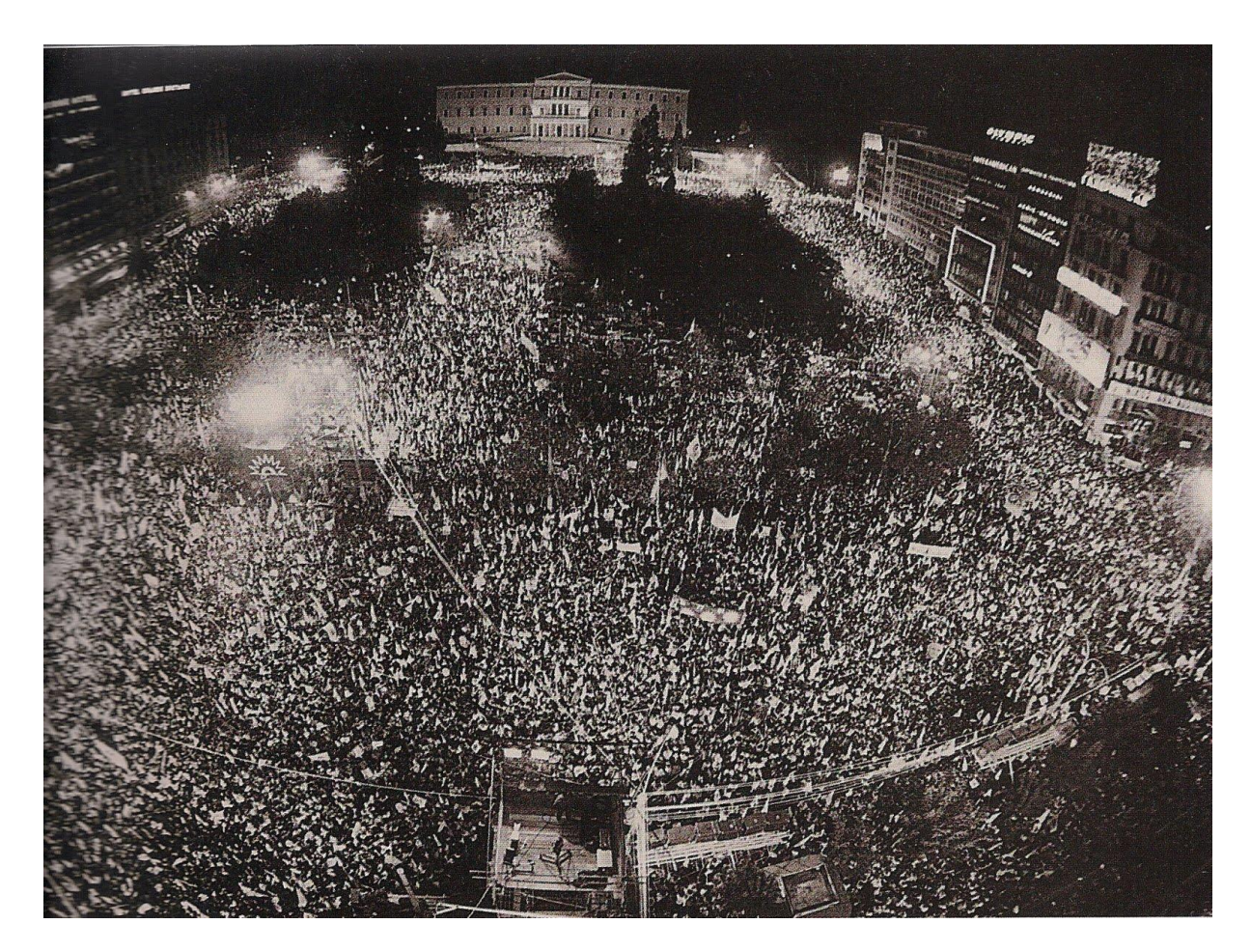
Fig. 1. The historical electoral rally of PASOK, Athens, 15 Oct 1981. Hundreds of thousands of backers of Andreas Papandreu were gathered then on the streets of the Capital between the squares of Syntagma (Constitution) and Omonia (Concord), and three days later contributed to a great victory in the elections

According to the expectations, the parliamentary elections of 18 October 1981 were clearly won by the socialist PASOK, who filled 174 seats in the Chamber of Deputees, giving it a comfortable majority. The defeated New Democracy had to resign itself to 113 seats, and the composition of the Parliament was completed by the Communist Party of Greece with 13 deputees<sup>6</sup>. The new Prime Minister Andreas Papendreu gave the first interview, transmitted by the ERT, to the American NBC network, "making many promises which awakened great expectations," but also "making a good impression thanks to his balanced, matter-of-fact replies, which incited a feeling of general satisfaction among the viewers".